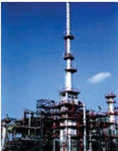
Fig. 5.5: A petroleum refinery

separating the various constituents/ fractions of petroleum is known as refining. It is carried out in a petroleum refinery (Fig. 5.5).