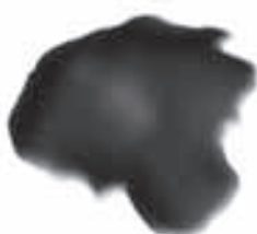
Fig. 5.3: Coal tar

It is a black, thick liquid (Fig. 5.3) with an unpleasant smell. It is a mixture of