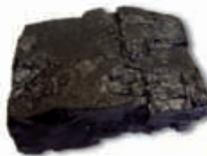
Fig. 5.1: Coal

You may have seen coal or heard about it (Fig. 5.1). It is as hard as stone and is black in colour.