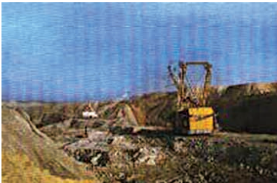
Fig. 5.2: A coal mine

When heated in air, coal burns and produces mainly carbon dioxide gas.